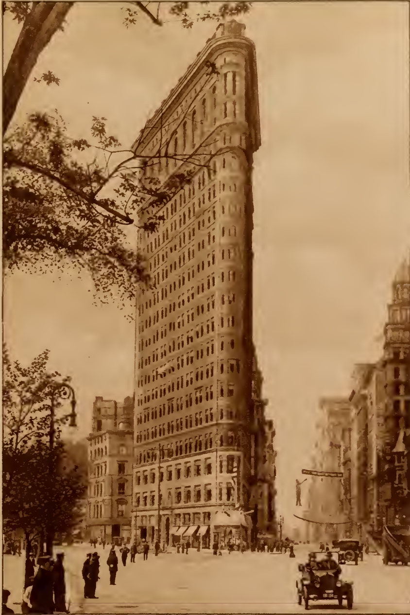
FLATIRON BUILDING, so called because of its shape, is situated on 23rd Street at intersection of Broadway and Fifth Avenue. It is 300 feet high.